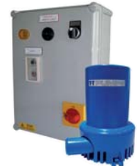
Mains/battery backup control panel for 12 volt pump