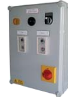
Mains control dual panel