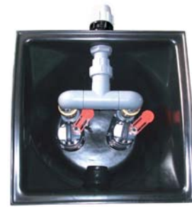
(Illustrates dual option)